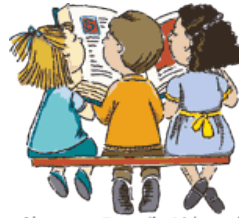
Share God's Word

Come and See! Object: A package of cookies.