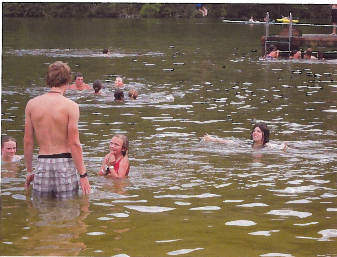
(Swimming in the Lake at the Annual Youth Summer Camp)

We also, as usual, held our annual youth summer camp for the local area children which of course included bible time, fellowship, swimming, biking, s'mores and all the expected silliness.