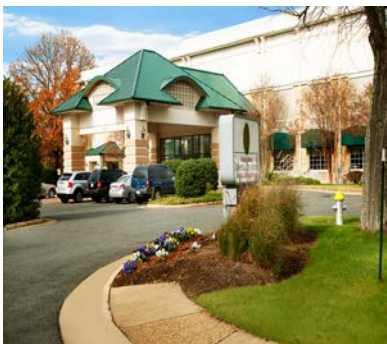
Fredericksburg Hospitality House and Conference House

The hotel is handicap accessible. Individuals are responsible for arranging any special accommodations or dietary needs with the hotel.