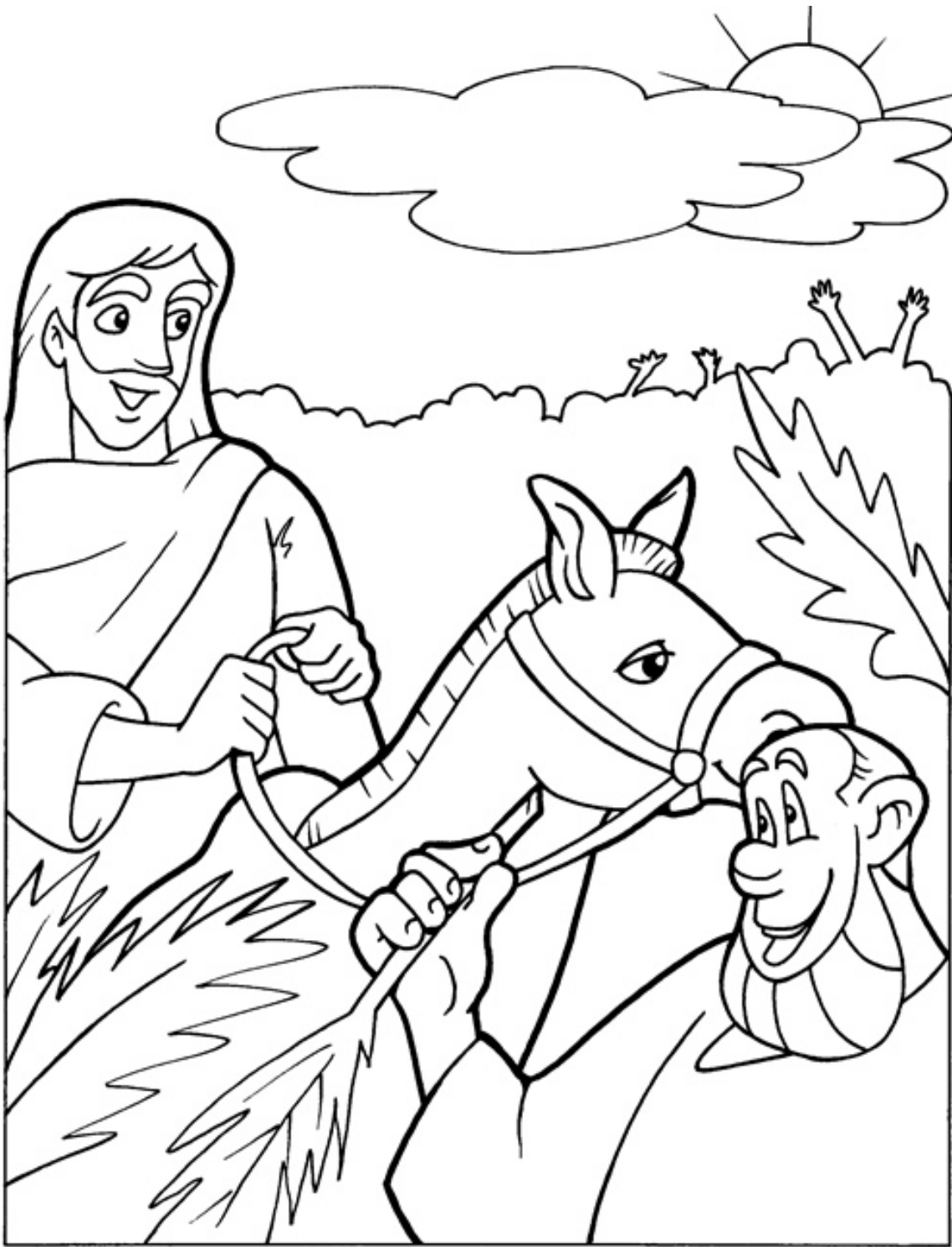
The Triumphal Entry