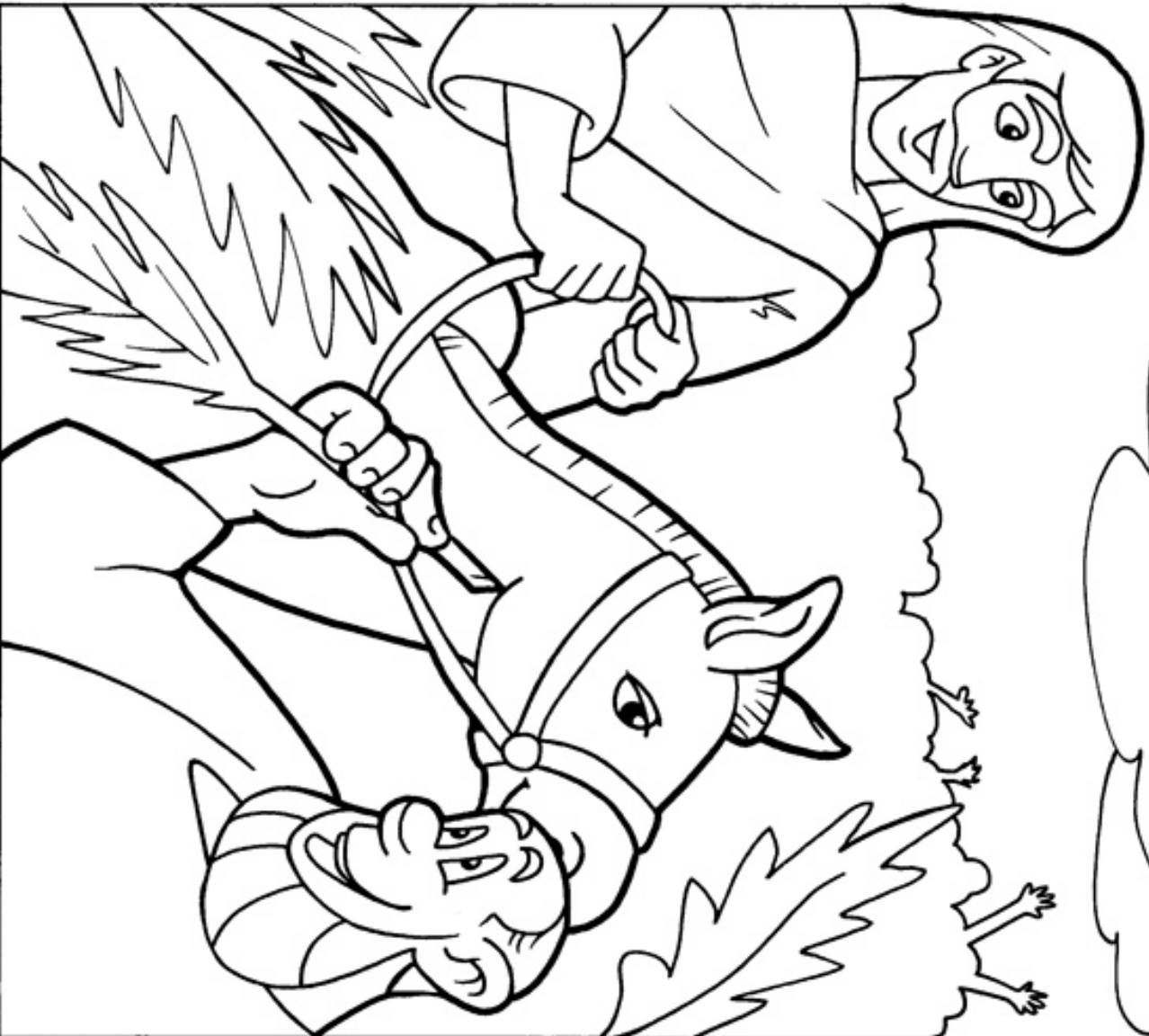
The Triumphal Entry