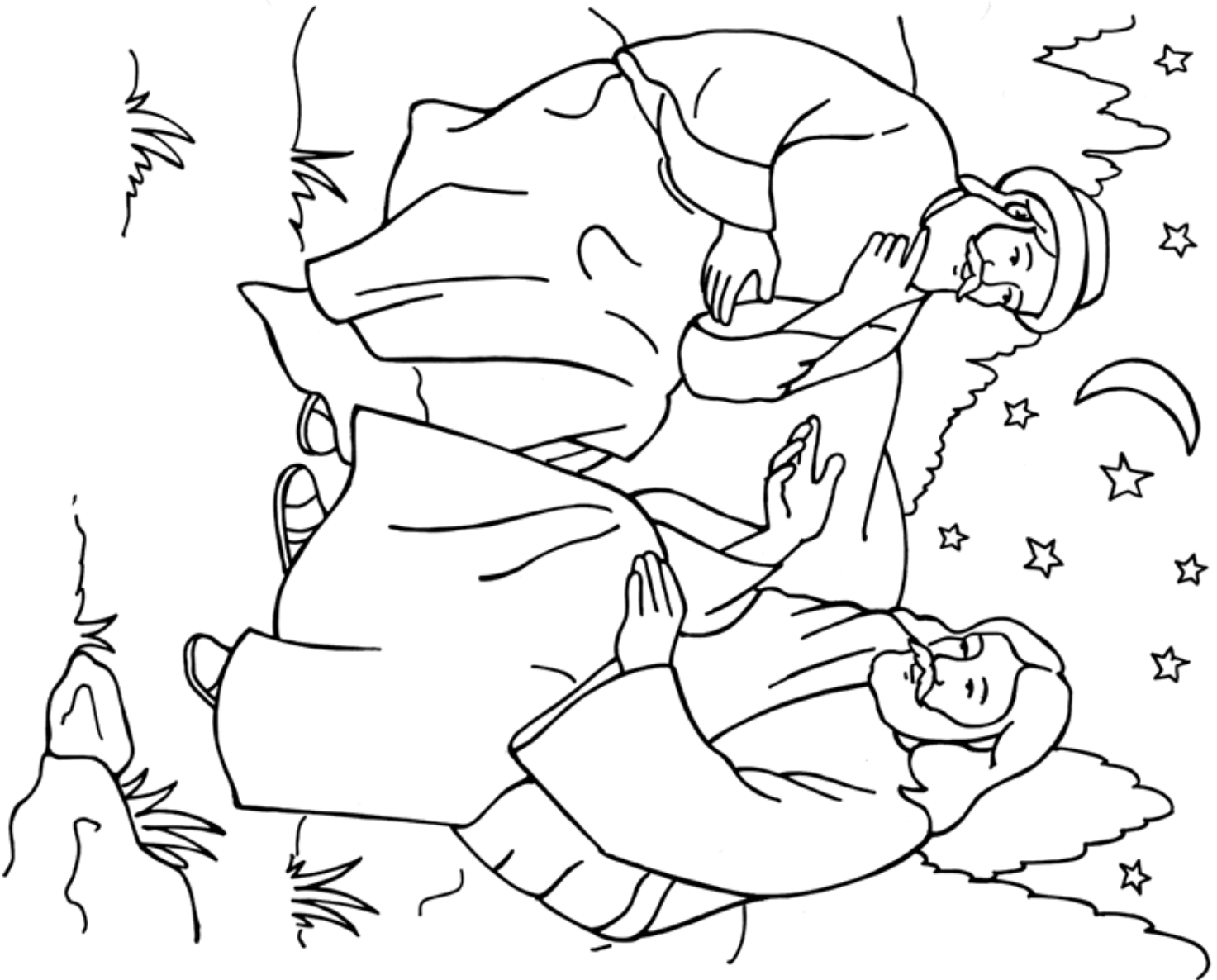
Jesus and Nicodemus John 3

From Thru-the-Bible Coloring Pages for Ages 4-8. © 1986, 1988 Standard Publishing. Used by permission. Reproducible Coloring Books may be purchased from Standard Publishing, www.standardpub.com , 1-800-323-5473.